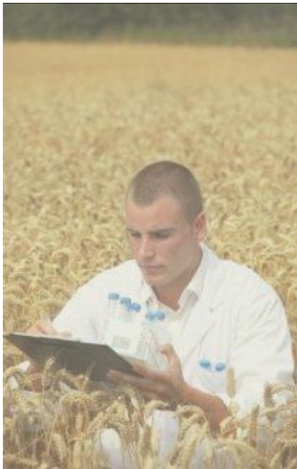
Strategic Research & Development